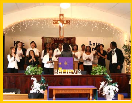
Black History Week February 2011 Western Carolina University Inspirational Choir