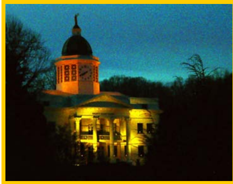
Old Court House (photo 2002) soon to be the new Jackson County Library Complex!