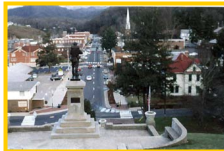
The view from our new office